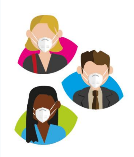
UNLESS YOU HAVE A VALID EXEMPTION