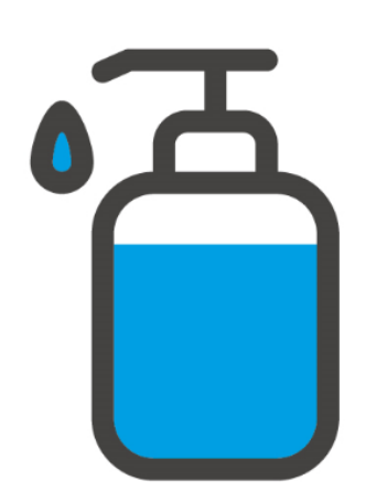
BEFORE AND AFTER SHOPPING